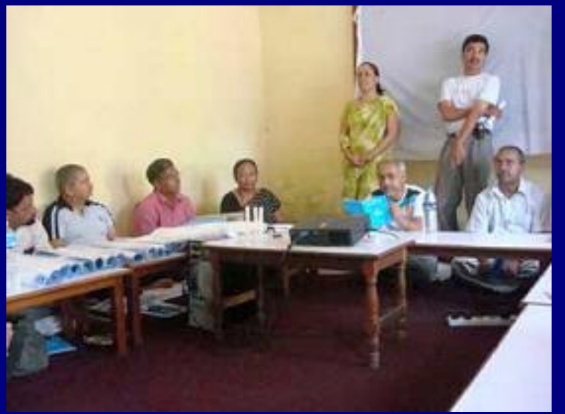
Alliance General Secretary, Secretary and other members taking part in Regional Assembly- Hetauda

The list of newly elected Chairperson for five Development Regions.