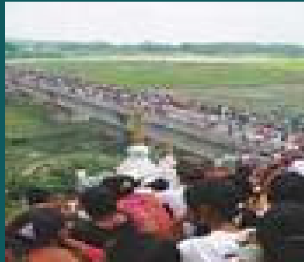
Refugees trying to cross Mechi Bridge

On May 30, Bhutanese refugees postponed their agitation for 15 days following the talks with the Indian security officials. According to Jhapa's chief