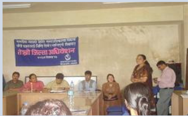
Chairman, Treasurer and other members taking part in Kathmandu District Assembly- Alliance Office Ktm

From the conclusion of these Regional Programs, Human Rights Alliance has identified and collected issues relating to Women, Youth and Socially Excluded Groups that are to be incorporated in the new constitution.