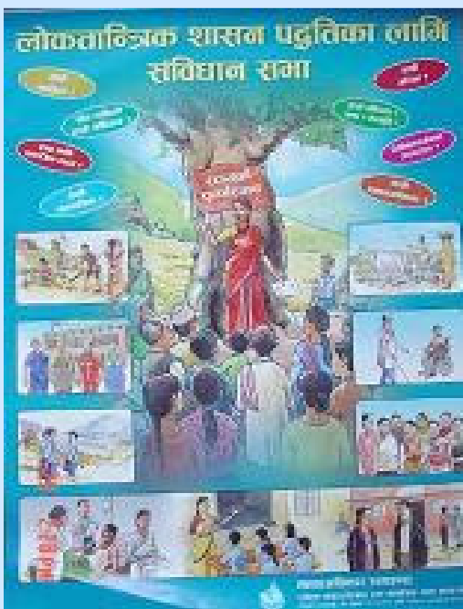
A poster developed by Alliance for raising awareness on CA election

Dispute erupted between the Bhutanese refugee factions-with one favoring resettlement in third countries and another for repatriation- broke out following a dispute with Hari Bagale Adhikari, the secretary of the camp. The bodies of two refugees, who were killed in the clashes, were handed over to their families after a post-mortem.