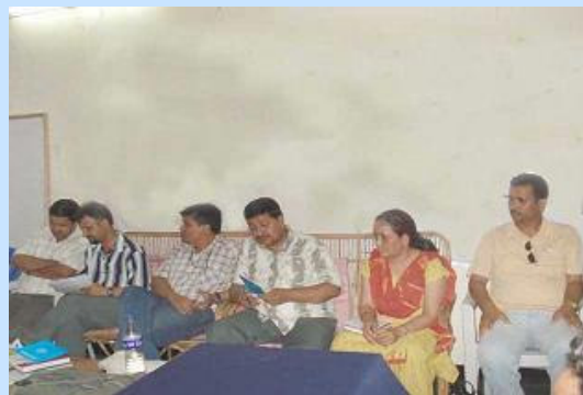
HR Alliance Chairman and General Secretary and other members taking part in Regional Assembly-Nepalgunj

Last month Human Rights Alliance successfully conducted District and Regional Assembly in the Far West-Dhangadi and Mid West-Nepalgunj, in which were present Chairman, General Secretary, Secretary, Executive Director and Central Committee Members of the Alliance.