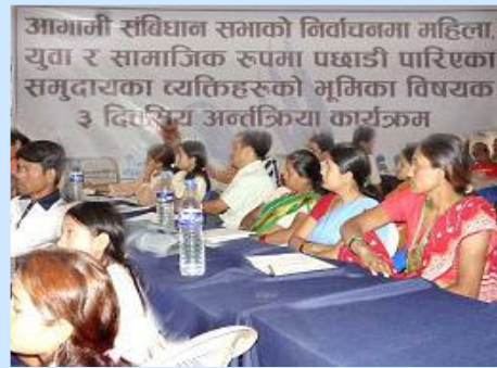
Participants in Regional Interaction Program

Seminar: In Nepalgunj the program was held on 26-28 April 2007 where some 50 women, youths and socially excluded groups actively participated. In Dhangadhi program held from 30 April to 2 May 2007, 74 people took part. Both the program focused on the need of bringing women, marginalized and